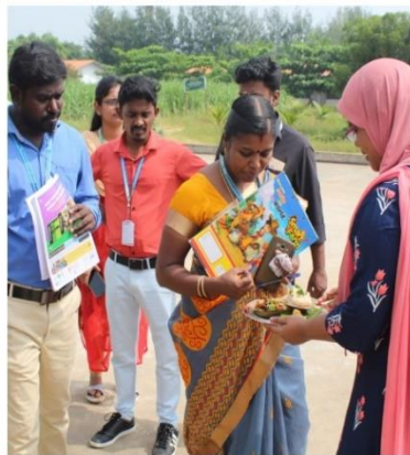
Food fest organised by the students of CAT on 22.12.2021 in the campus to know more about the food they are consuming on day to day basis and to pass on the information to peers adding taste and flavours to humdrum routine of CAT family.