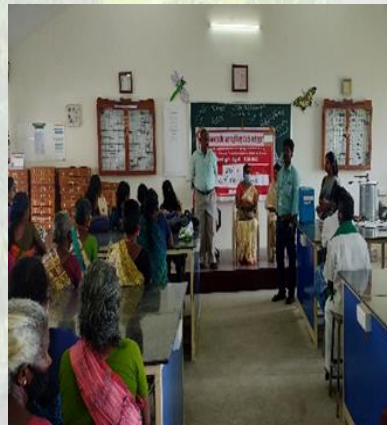
Honey bee training was organized for Gullapuram farmers.