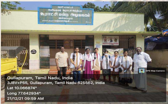
Organized Medical Camp at adopted villages of UBA project namely Chandrapuram, Kullapuram, Marugalpatti, Pomminaickenpatti, Renganathapuram from 20-12-2021 to 24-12-2021 in which CAT Theni is one of the Participating Institute.